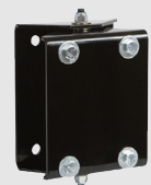
1282A - Swivel Bracket