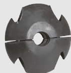
1233A - 3/8"