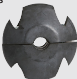
1232A - 1/2"