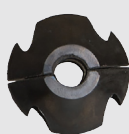
1234A - 1/4"