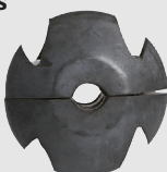
1232A - 1/2"