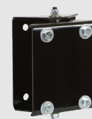
1282A - Swivel Bracket