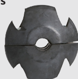
1232A - 1/2"