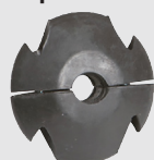
1233A - 3/8"