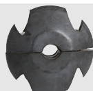
1232A - 1/2"