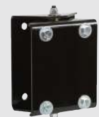
1282A - Swivel Bracket