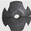
1232A - 1/2"